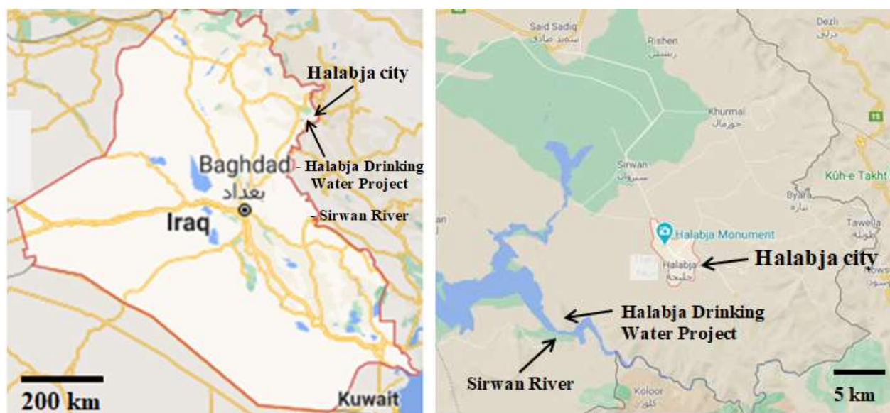
Figure 1: Map of the study area. Samples were collected from both the Halabja Drinking Water project and Halabja city [16].

The current research conducted on the Halabja drinking water station which take water from Sirwan river. The area is located between 35^{\circ}11'11'' N latitudes and 45^{\circ}58'26'' E longitude. It is located 240 km northeast of the capital Baghdad, near the Iranian border. Its population generally relies on different sources of drinking water, which include Ahmad Awa Lake, wells, and, water from the Halabja Drinking Water Project. About three-quarters of Halabja's drinking water are supplied by the Halabja Drinking Water Project, which is sourced from the Sirwan River. This river extends from east to southwest of Halabja about 12 km far from the Halabje city as shown in (Figure 1).